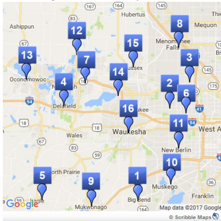
Figure 1. Waukesha County Libraries

There are sixteen public libraries in the county (Figure 1.) providing library services (shown in Appendix D) to residents of Waukesha County. A resident may visit any of these public libraries to seek information, materials, and services. The sixteen libraries are located throughout Waukesha County.